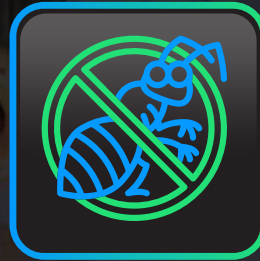
Anti-ant Insulation System