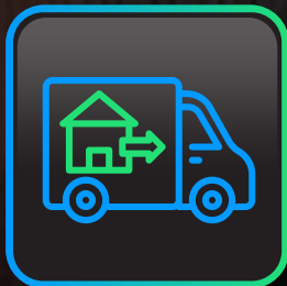
Easy Move Around