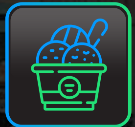
Capacity 90 Cups