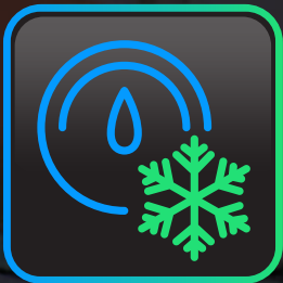
Freezing Temperature -36.4°F / -38°C