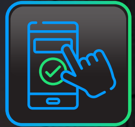
QR Code Payment